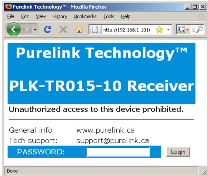
Figure 2: Receiver Web Interface Login Screen

To log onto a receiver, enter the IP address in Firefox 2.0 - 3.0 or Internet Explorer 6.0. The default IP address for all receivers is 192.168.1.101 . The login page will appear, as in Figure 2. The default password for receivers is admin . Once the password is entered, click on the login button. The receiver will load the configuration page, as in Figure 3.