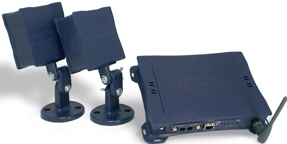
Purelink's PLK-TR015-10 Wireless Location Receiver

The PLK-TR015-10 supports three location modes in Bluefairy™ Computing Engine: high-accuracy location mode, visibility mode and checkpoint mode. Purelink's PLK-TR015-10 is the only infrastructure equipment required to install in an enterprise in order to run location-aware people and asset tracking applications. Increasing coverage is as simple as adding more location or visibility receivers.